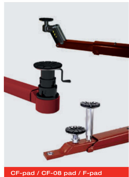
CF-pad / CF-08 pad / F-pad